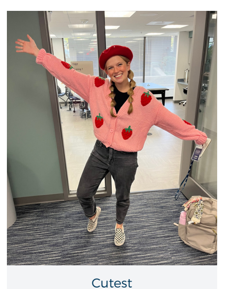
Best Look Alike

See the results of the Halloween contests below!