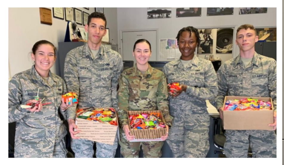
Thank you to everyone who participated in the SOTA Halloween Party and candy drive!

The holiday festivities encouraged lots of fun social engagement between students.